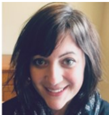
Atta Cucina, RN

YOUR 8333 LEWINSVILLE ROAD TEAM CONTACTS