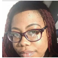
LaToya Jackson Lead